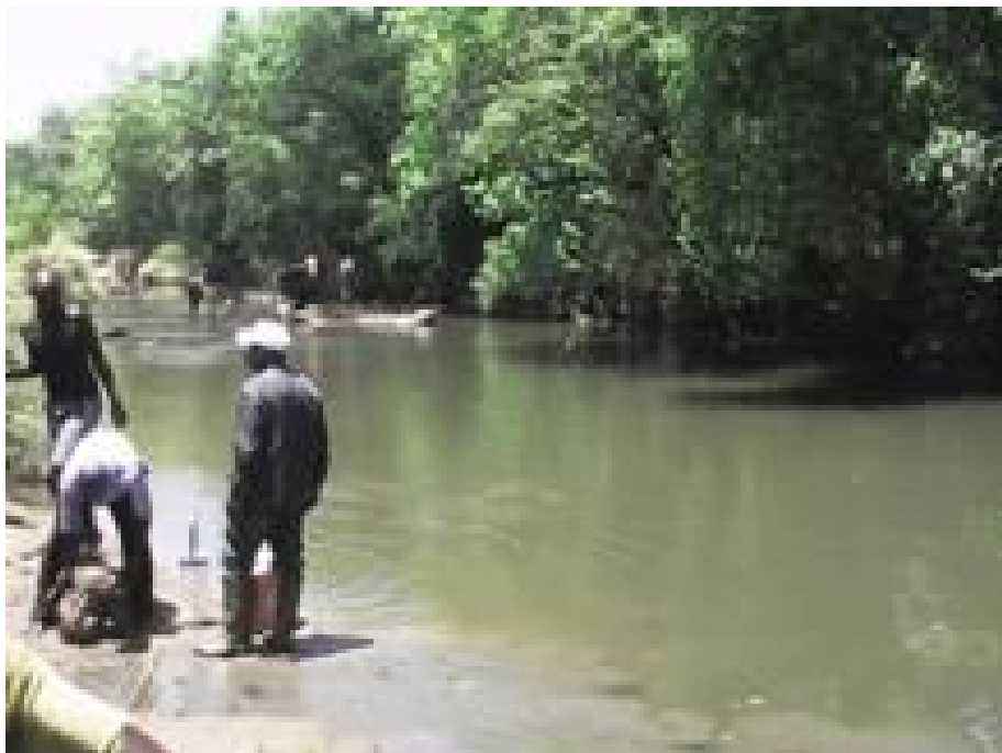
Figure 2. Section of River Aswa with thick acotone zone in the background.

Note the mainstream being detached from the floodplain and exposed bottom rocks in the background.